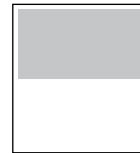
1/2 Page 165 mm x 97 mm 6.5" x 3.8"